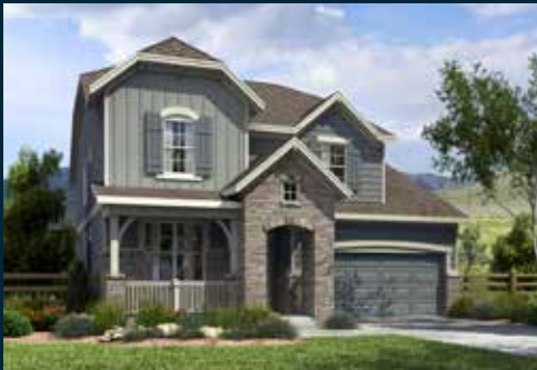
EURO COUNTRY ELEVATION