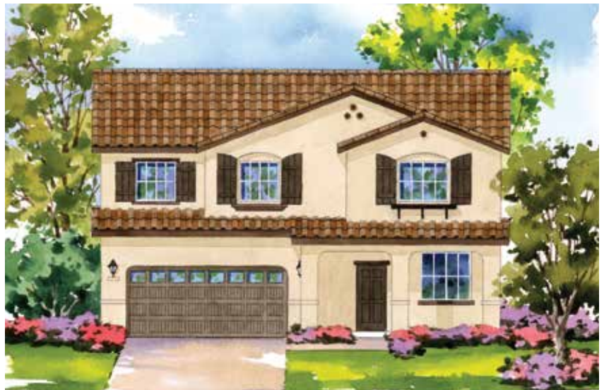
ELEVATION C SPANISH