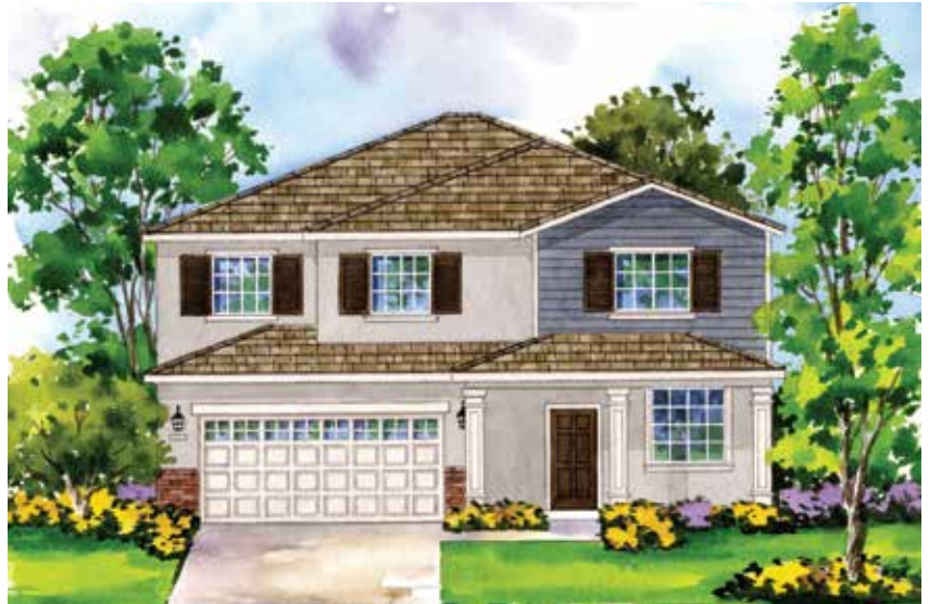
ELEVATION B TRADITIONAL