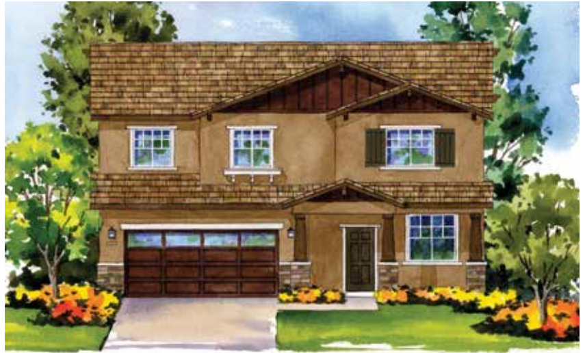
ELEVATION A BUNGALOW

William Lyon Homes ® Experience the pride. ™