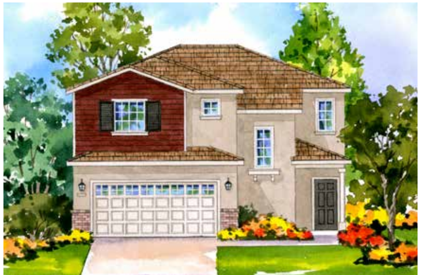
ELEVATION B TRADITIONAL