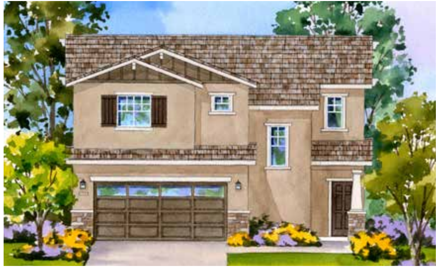
ELEVATION A BUNGALOW

William Lyon Homes ® Experience the pride. ™