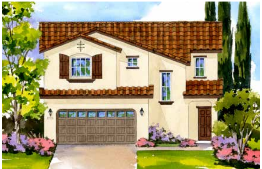
ELEVATION C SPANISH